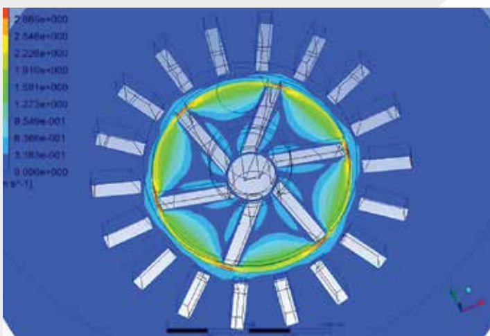
Backward inclined Rotor Blades